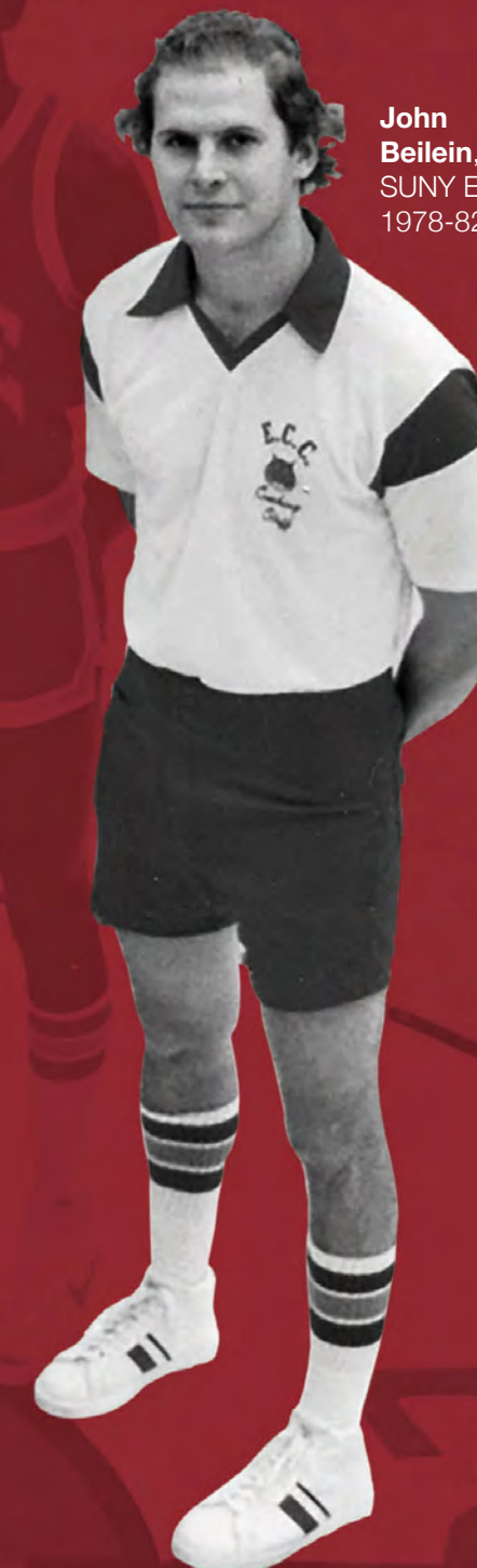
John Beilein , SUNY Erie 1978-82

"SUNY Erie is a place of opportunity, a gateway to the future. It gave me the tools for academic and athletic success. The connections I made allowed me to go to my dream school, Penn State. SUNY Erie turns dreams into a reality. Thank you."